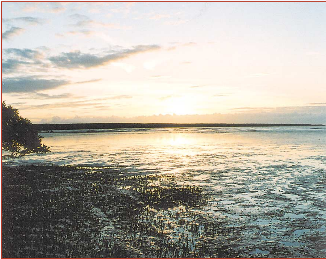
Kimberley Community Profile/CAS

Dignity and justice for our Indigenous sisters and brothers