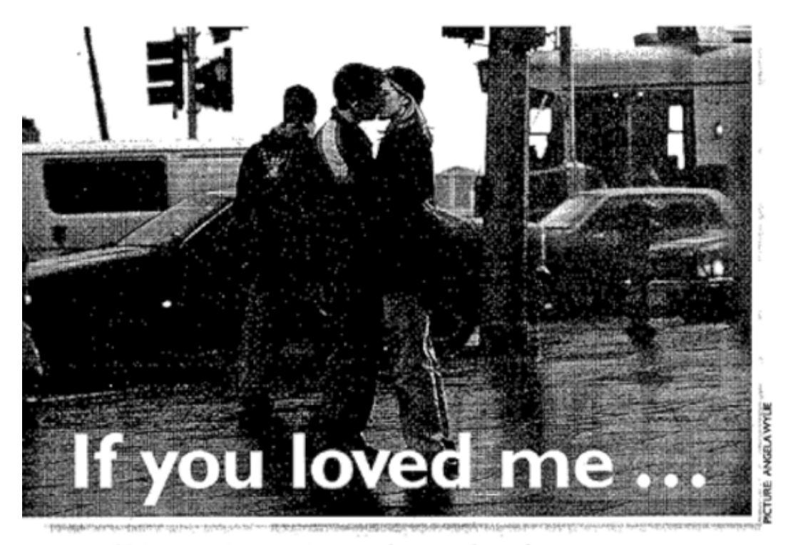
Girls want love and commitment; boys just want sex. Teenage sexuality is still the emotional minefield it has always been, but what really makes young people decide to "do it" or not?